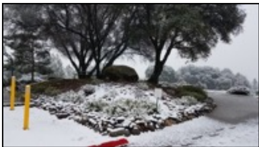
Snow at Sierra Pines