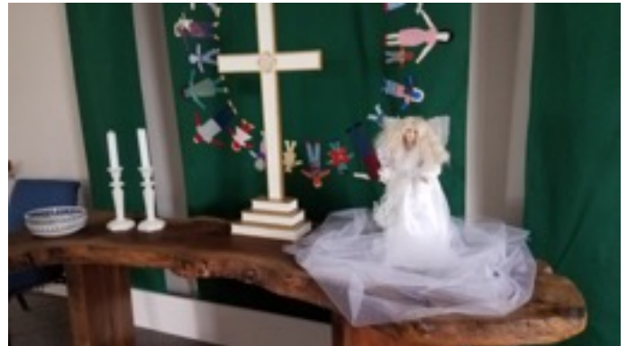
One of the Altars for Sermon Series: Fear<Less