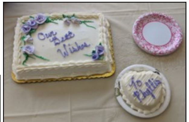
Celebrating Phyllis's 90th Birthday We also celebrated Al's 90th Birthday