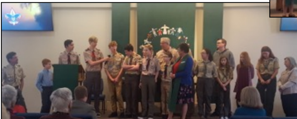
Scouting Sunday, February 10, 2019 BSA Troops 783 & 583 The Place to Be