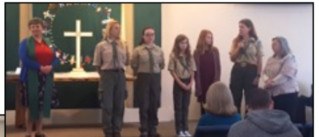
New BSA Troop for Girls Troop 583

Turn your clocks forward before bed Saturday, March 9th