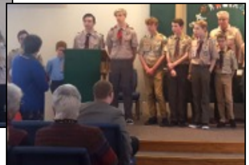
BSA Troop 783